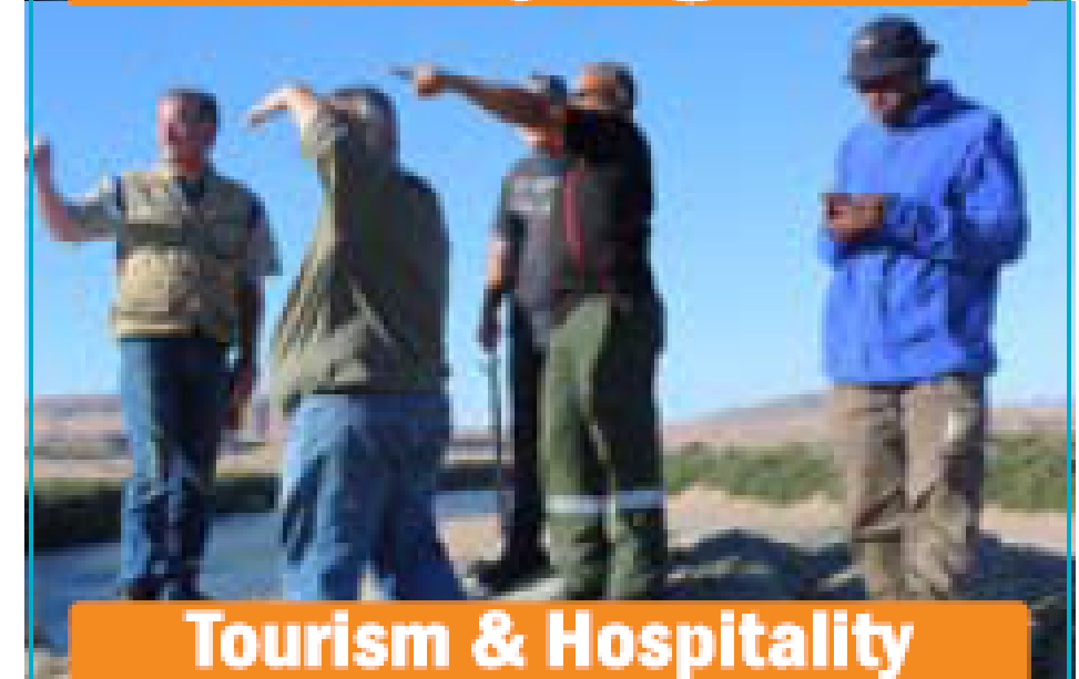
Tourism & Hospitality